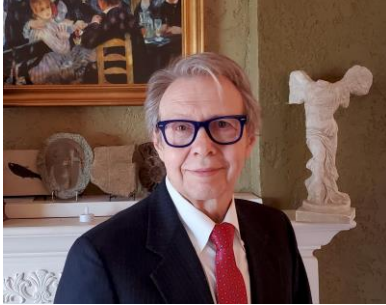
Surrounded by reminders of long healthy life